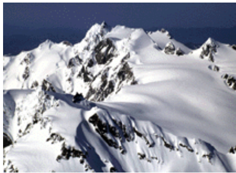
Stay warm in this cold weather!

this Saturday, February 12th. Students will be taking the PSAT/SAT from 9:00 - 12:00 and the students who will participate in this event will receive a free dress pass. There are also amazing prizes for the best scores.